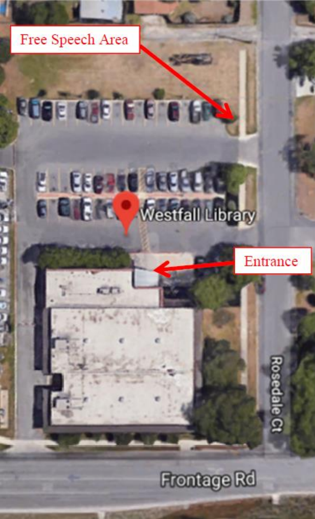
Westfall Library (Docket no. 31-2 at 6)

In contrast to the library’s free speech areas, there is no such zone on the grounds of the senior center. Docket no. 31-3 at 4; docket no. 31-3 at 4, 9. Because the City’s senior centers receive federal grants, they are subject to Texas Department of Aging and Disability Services regulations barring distribution of “political materials” and prohibiting political campaigning unless each political party running is given an equal opportunity to participate. 40 TEX. ADMIN. CODE § 85.309(d). The senior center’s policy (the “Political Activity Policy”) with respect to activities inside the senior center is intended to protect the centers from “political pressure, to prohibit use of City of San Antonio resources for political purposes, and to avoid the appearance