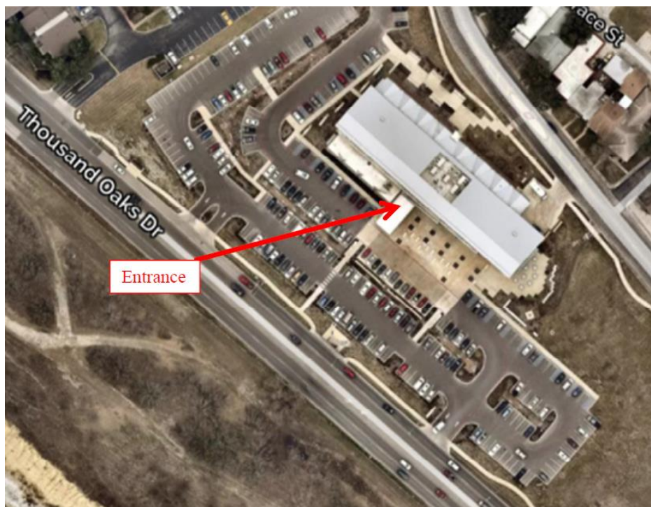
Northeast Senior Center (Docket no. 31-3 at 3)

of bias or favoritism.” Docket no. 31-3 at 9. The policy prohibits the centers from “endors[ing] any candidate, party, or issue” and prohibits the presentation and posting of political and campaign materials. Id. at 9-10. The senior center manager must approve in advance anyone that wants to make a presentation at the senior center. Docket no. 50-2 at 54-55.