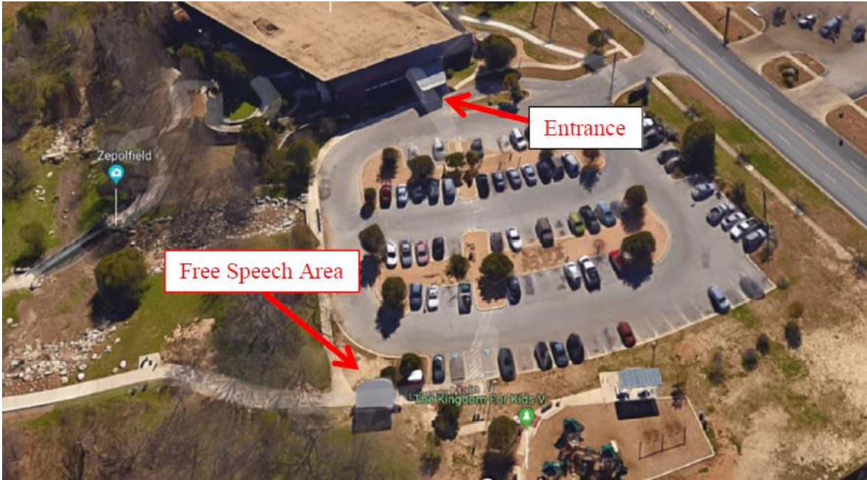
Julia Semmes Library (Docket no. 31-2 at 5)