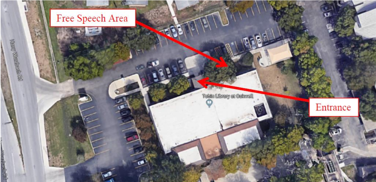
Tobin Library (Docket no. 31-2 at 3)