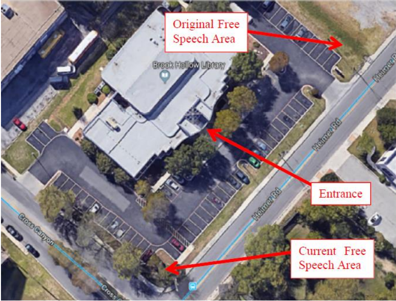
Brook Hollow Library (Docket no. 31-2 at 7)